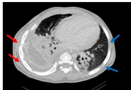
Figure 1: Right intercostal spaces appeared fused with adjacent ribs (red arrow) in compared to left intercostal spaces still having wide space (blue arrow).

with collapse consolidation of the right lung. She was ventilated in the paediatric intensive care unit and intravenous ceftriaxone commenced. Initial ultrasound of thorax on day 2 of admission revealed consolidation of the right lower lobe. Blood cultures were positive for streptococcus pneumonia.