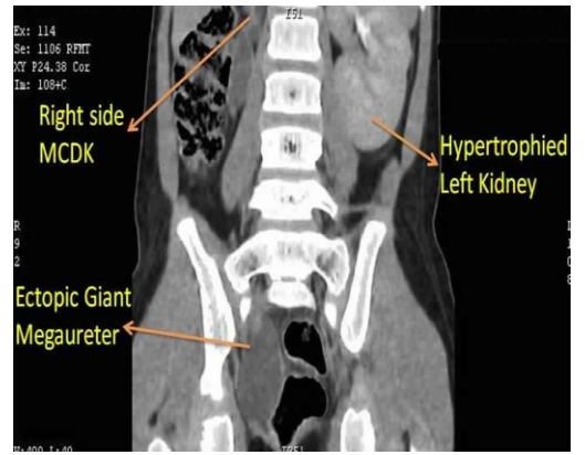
Figure 1: Contrast enhanced CT scan showing right side ectopic giant megaureter with ipsilateral MCDK.

proximal right ureter in delayed films. Right ureter was dilated on its entire course with more pronounced dilatation of distal ureter (3.2 cm) and ectopic extravesical insertion of distal ureter into cervicovaginal canal [Figure 1]. DTPA scan confirmed negligible function of right kidney. Preoperative cystogenitoscopy confirmed right hemi-trigone and non-localization of right ureteric orifice. With all investigation the final diagnosis was single system ectopic congenital giant megaureter with ipsilateral multicystic dysplastic kidney (MCDK) for which laparoscopic nephroureterectomy was performed [Figure 2]. The child is asymptomatic during follow up.