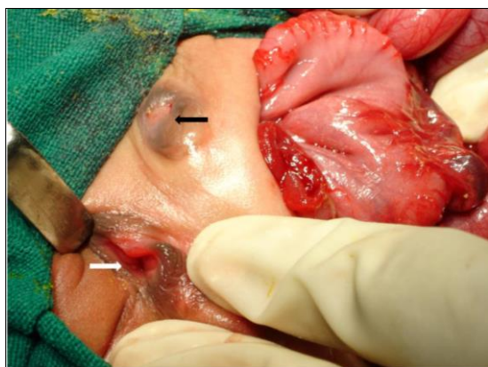
Figure 1: Photograph at surgery showing the type II colonic pouch, the external genitalia (white arrow) and the low-set umbilicus with scarring around it (black arrow).

Case 1: A 20-day old full-term girl, weighing 3.1 kg, was brought with complaints of passing urine and stools from a single perineal opening. The baby was feeding normally and thriving. There was no significant antenatal history. Examination revealed the stigmata of pseudoexstrophy with a low-set umbilicus, scarring around the umbilicus, and wide pubic diastasis (Fig. 1).