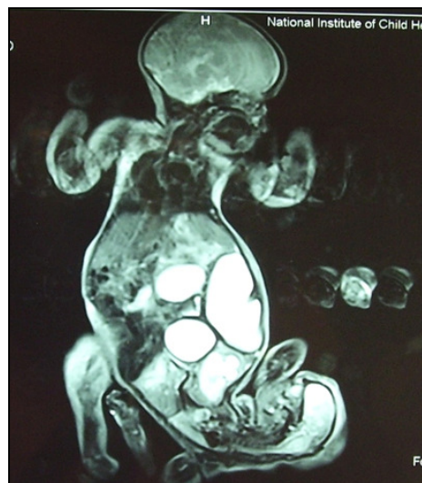
Figure 5: MRI of conjoined twins.

bladder as noted on cystogram, ultrasound abdomen and MRI.