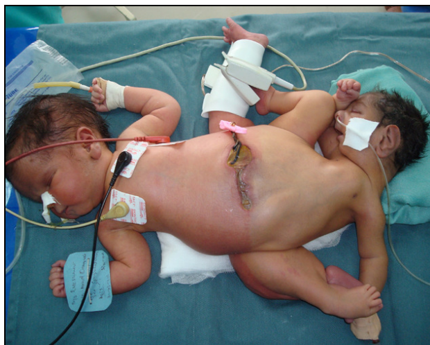
Figure 1: Ischiopagus tripus conjoined twins.