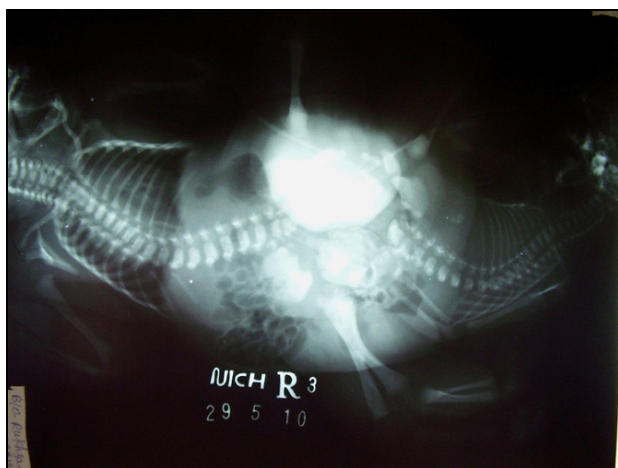
Figure 4: Cystogram - showing pooling of contrast in a single reservoir (common urinary bladder).

terminal ileum (at Meckel's diverticulum) with shared bowel distally or rarely the sharing is only colonic. The rectum and the anus may be single or imperforated. Obstructed GI or genitourinary tract, ruptured omphalocele, severe respiratory distress or cardiac failure in one of the twins, are some of the indications which may require emergency surgery [1,2,5,8].